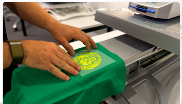
Sleeve/Leg 6" x 20" - reduce by 60%